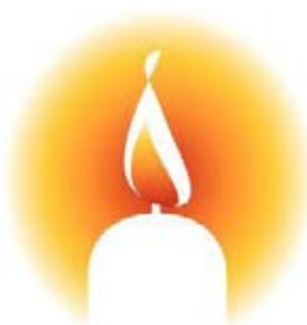
Compline Worship Service